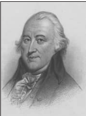
Artemas Ward played a critical role in organizing and leading the Massachusetts army in the spring of 1775 and served as Gen. George Washington's second-in-command after Washington arrived in July.

in colonial America to oppose British policies and taxation, and a leading voice in the growing provincial government of Massachusetts, was busy collecting depositions from eyewitnesses. As Warren undertook this mission, Maj. Gen. Artemas Ward, 47-years-old, of the Massachusetts militia, made his way by horseback toward Cambridge and the Jonathan Hastings House.