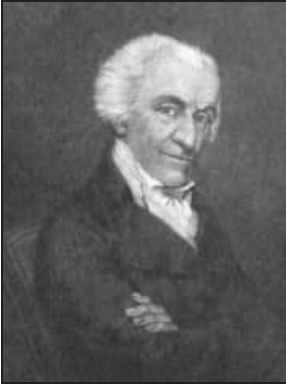
Elbridge Gerry assisted with governing in the Massachusetts Provincial Congress after Lexington and Concord. (mypl)

The colonial force continued to be in flux, as men trickled in and out of the encampments. Numbers would grow as the chance for another confrontation beckoned, the men fated to play a role in the next battle.