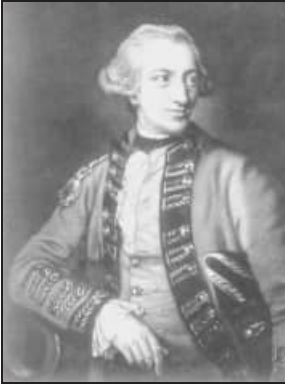
Lord Hugh Percy led a relief force to the aid of the British expedition to Concord and continued in service with the British Army until disagreements with Lt. Gen. William Howe led him to resign in 1777. (wiki)