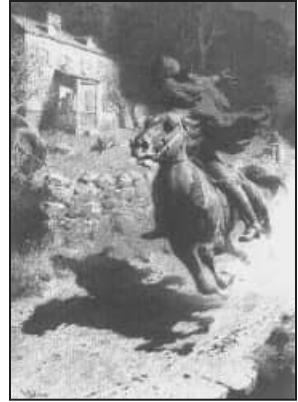
Although drawn in the 20th century, this rendering may have authentically captured a single moment in Paul Revere's ride.

In 1875, on the battle's centennial anniversary, 350,000 people came to Boston to commemorate and honor Warren and his fallen comrades. That day also served as a healing moment for the nation, marking the first time since the start of the Civil War that Northern and Southern troops marched in unity.