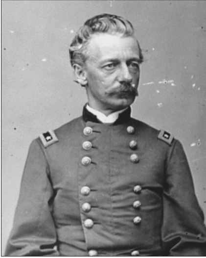
Maj. Gen. Henry W. Slocum