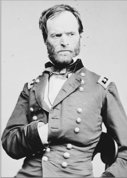
Maj. Gen. William T. Sherman

Sherman was already in deep discussion with the Union army's commander-in-chief, Lt. Gen. Ulysses S. Grant, as to his next move. Grant's first thought was to transfer Sherman's army north to Virginia to join him in confronting Lee's Army of Northern Virginia. Grant wrote, "I had no idea originally of having Sherman march from Savannah to Richmond, or even to North Carolina." 2